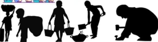
ARTICLE OF THE WEEK

160 M Approximately 160 million children worldwide are involved in child labor, which represents 1 in 10 children.