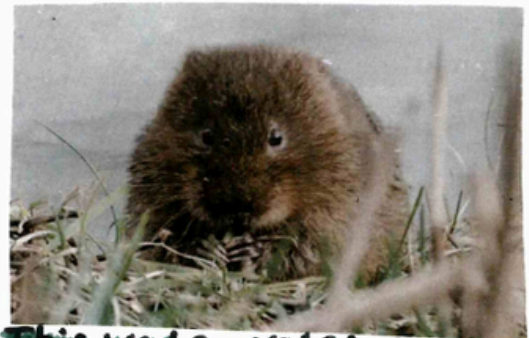
This water vole's population has decreased 95% since 1970!

If £1000 is raised, homes for water voles like this little guy could be made across rivers all over England and Wales.